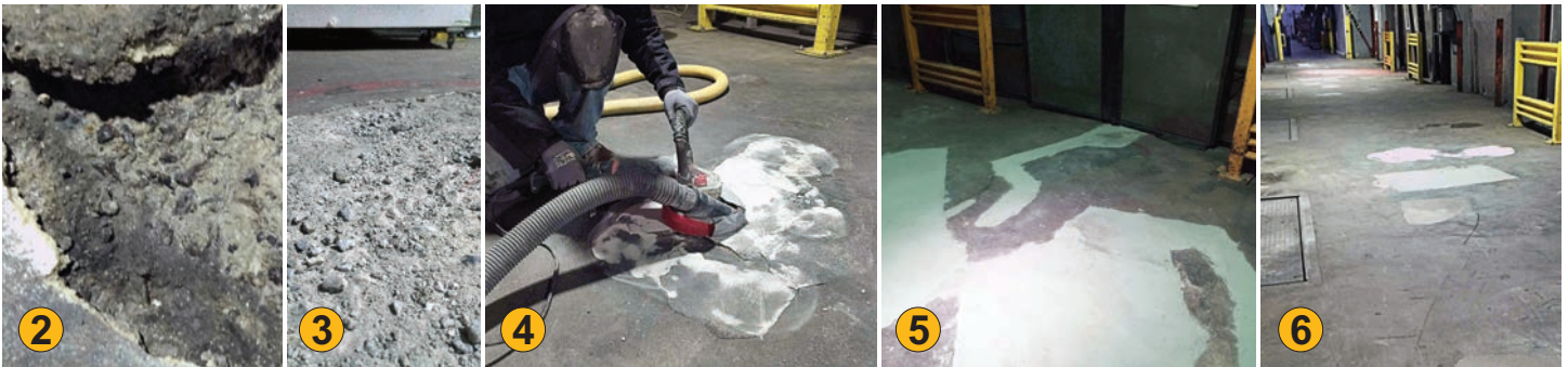
Photos: (1) (Top Right) Removal of spalled floor sections; (2, 3) Closeup of damaged flooring; (4) Leveling floor after repair; (5) Patched area leveled and cured; (6) Overview of repaired areas, lighter colors show some of the repaired areas.

• For more about Perry's Ice Cream, visit www.perrysicecream.com